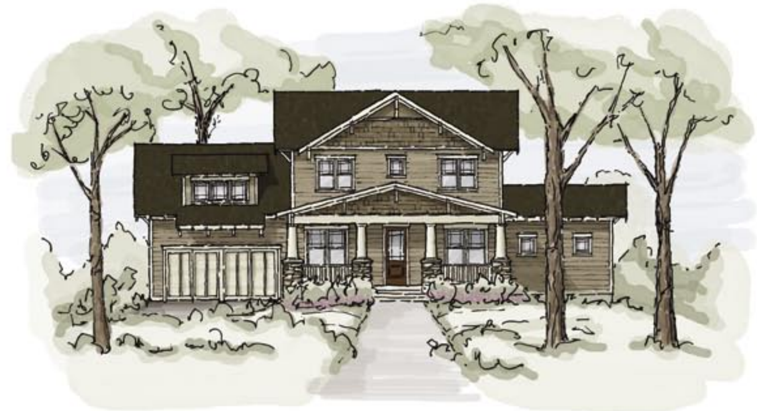
The Montreat Craftsman