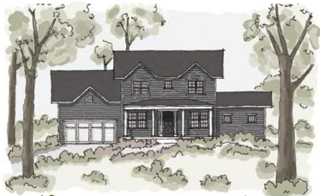
The Montreat Farmhouse