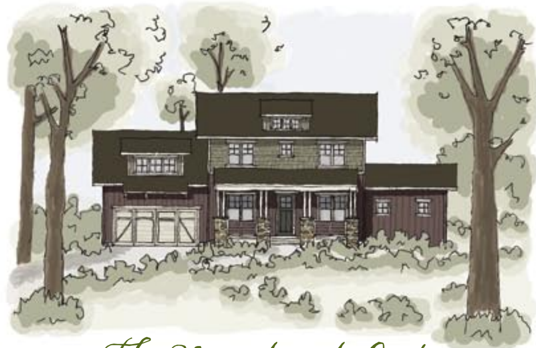
The Montreat Lodge