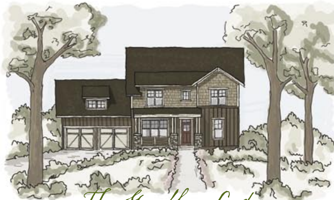
The Gaulley Lodge