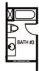
Gaulley Optional Bath #3- Deletes open Foyer

All dimensions and specifications (including square footages) are approximate and artist's conceptions. Product availability, prices, floor plans, elevations, and specification levels are subject to change without notice or obligation.