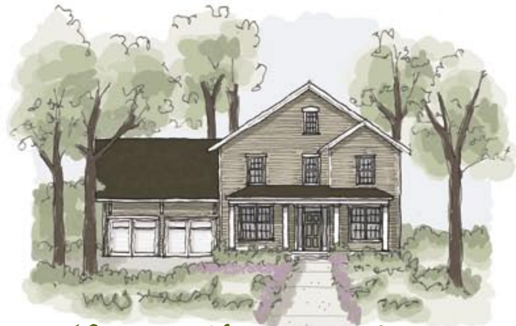
The Gaulley Farmhouse