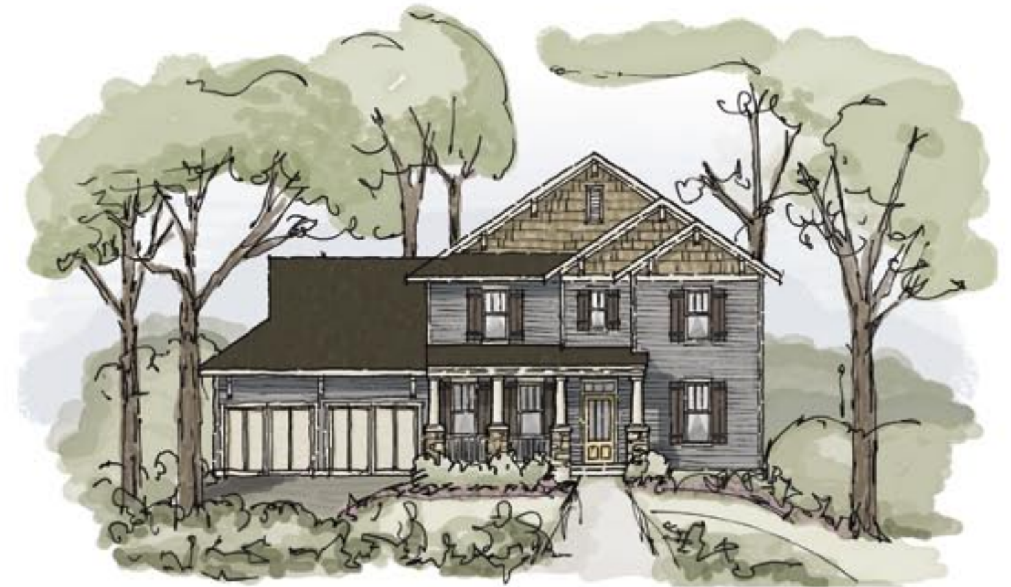
The Gaulley Craftsman